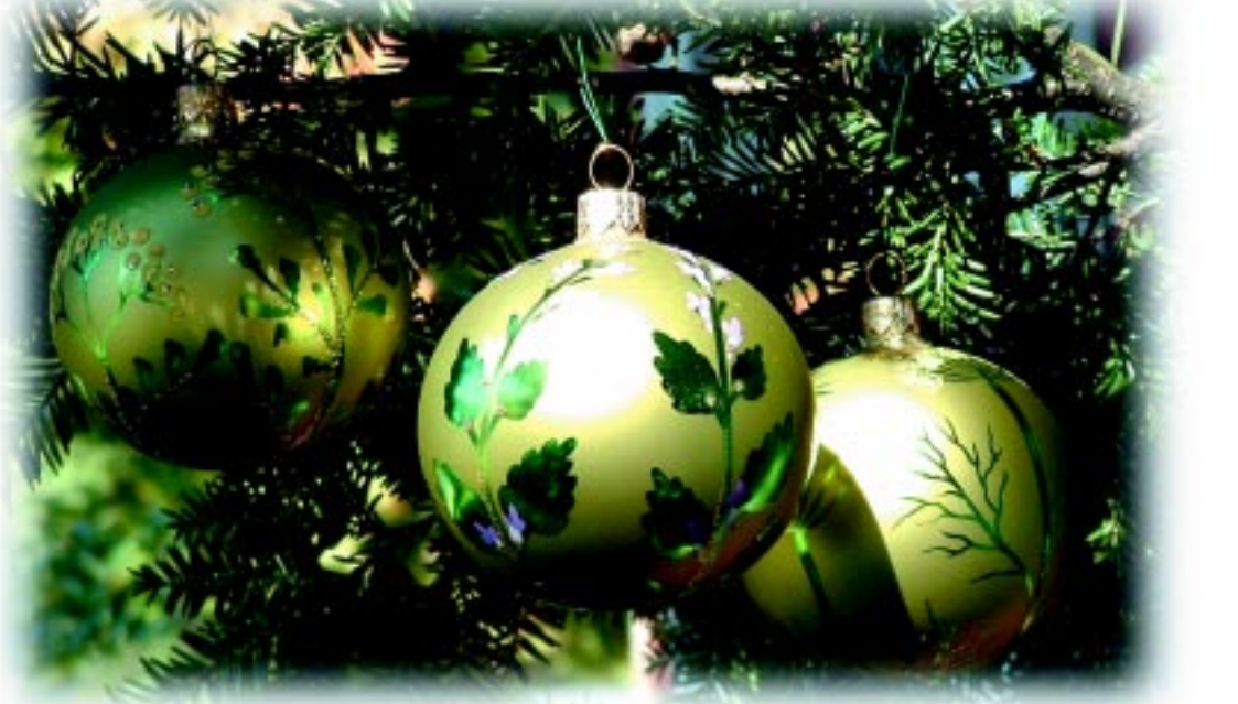
Three designs from our "Herbs of the Bible" collection. From left: Tansy, Catmint and Dill.

Check out Behnke's Holiday Shop. In addition to these herbal ornaments you'll find a complete line of gifts and decorations, including hand made crafts from the Chesapeake Woodturners.